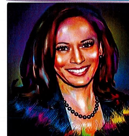
Congratulations Kamala Harris, first Black and Asian woman elected Vice President of the United States!

I'm going to stay up on New Year's Eve this year. Not to see the New Year in, but to make sure this one leaves.